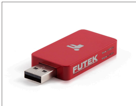
HIGH SPEED/RESOLUTION USB USB220