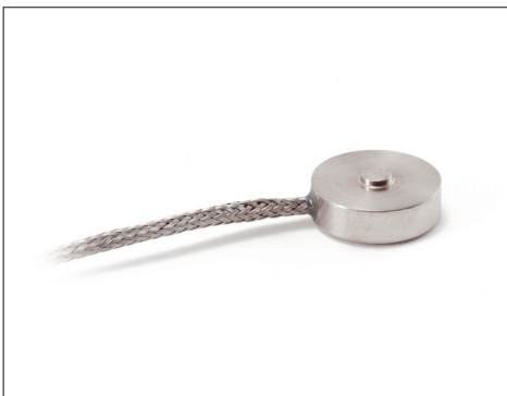
MINIATURE LOAD BUTTON LLB130

Finally, given the varying labs and test environments that robotic prosthetics are tested in, flexibility and ease of interface to lab computers is essential. Here, FUTEK's miniature button load cells interface with not only PLCs, but also FUTEK's USB 24-bit interface kits paired with their SENSIT™ Test and Measurement Software for live logging and graphing on a PC.