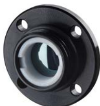
TM-CF-CX Ancillary CF lens, TM-PW-CX Protective window