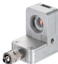
TM-APLCF-CS Air purge collar, laminar with integrated ancillary CF lens