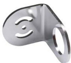
TM-FB-CS mounting bracket, fixed