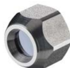
TM-CF-CS Ancillary CF lens (only for LT models)