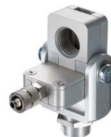
TM-APL-CS Air purge collar, laminar TM-MG-CS Mounting fork