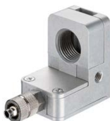
TM-APL-CS Air purge collar, laminar