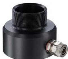
TM-AP-CX Air purge collar for CX sensors