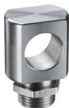
TM-MB-CS Mounting bolts with M12x1 thread adjustable in one axis