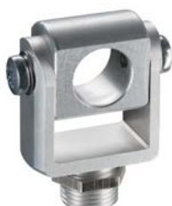
TM-MG-CS Mounting fork with M12x1 thread, adjustable in two axes