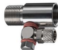
TM-AP-CS Air purge collar for 10:1 sensors