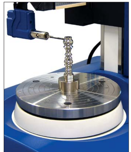
ultra high precision air bearing spindle