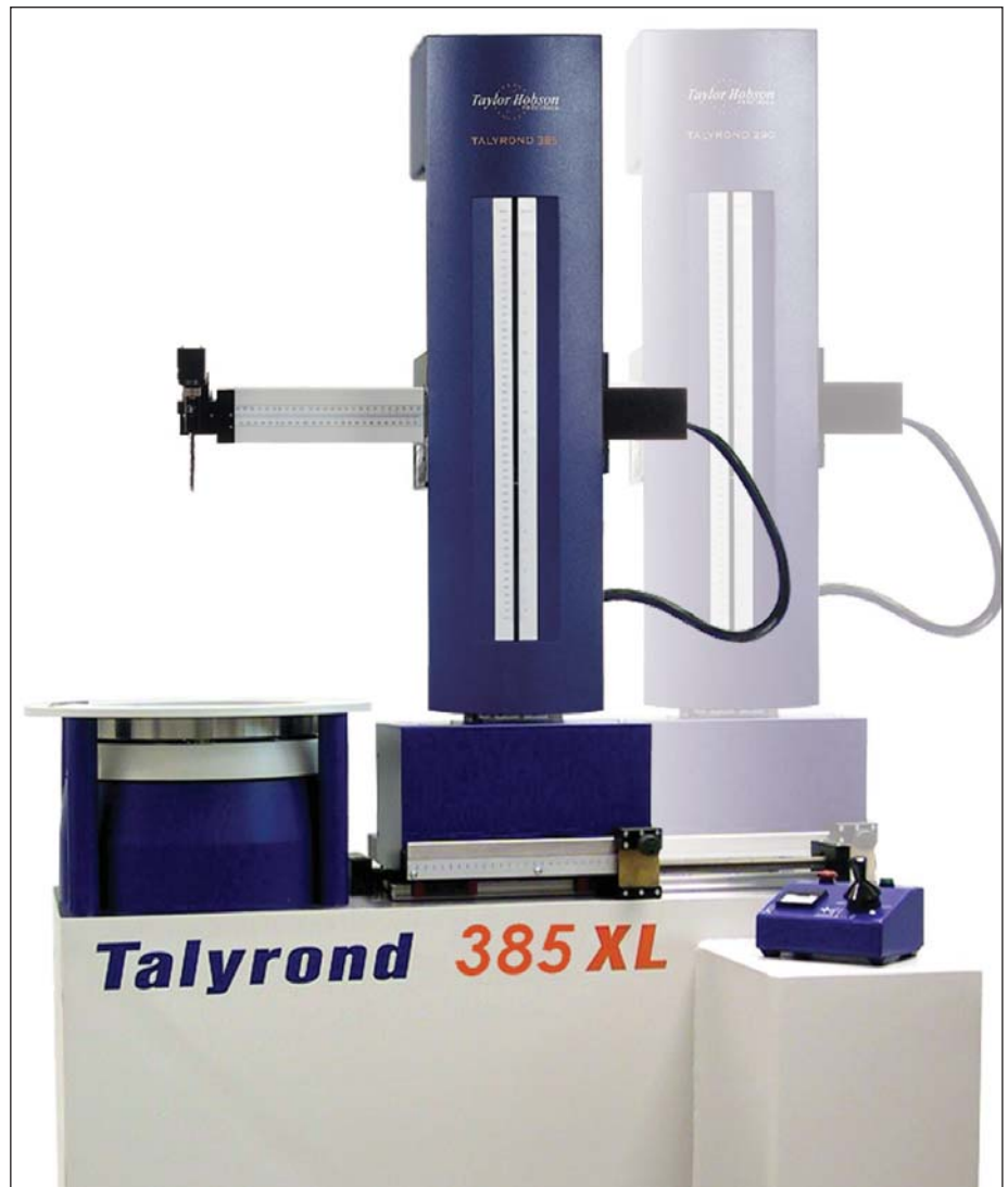
Talyrond 385 XL with adjustable column position

The column and arm of the XL range are capable of following the eccentricity and contour of the part outside of the normal gauge range reducing the need for manual pre-centering or the use of expensive work holding fixtures. This particular feature is a must for large diameter parts where pre-centering is more difficult.