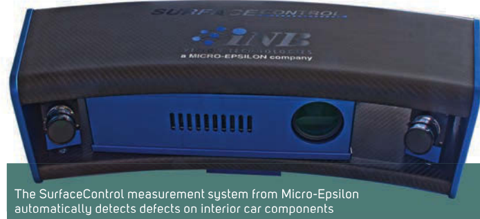
The SurfaceControl measurement system from Micro-Epsilon automatically detects defects on interior car components

surfaces, such as interior automotive parts. SurfaceControl offers a variety of measurement areas ranging from 150 x 100mm 2 to 600 x 400mm 2 , and it takes only a few seconds to capture 3D data for a surface. Various evaluation procedures are available, depending on the nature of the shape deviations being investigated. The 3D data can be used to calculate a flawless virtual cover, or a digital whetstone can be used, similar to a whetstone in a press shop. These methods provide repeatable, objective assessments of deviations from around 5µm to 20µm, depending on the surface. The structured light projection procedure is suitable for all surfaces that diffusely reflect at least part of the light, including steel, aluminum, plastics and ceramics.